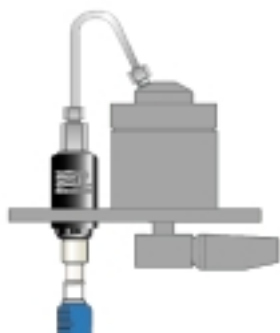
Fig. 2. Suggested mounting arrangement of Models 7012 and 7010.

Model 7010 uses the complete-filling method of loading the sample loop. This highly reproducible method is for routine analyses in which your sample loop regulates the sample volume. Excess sample is required to completely flush mobile phase from the loop. Applications requiring zero sample loss should use the Rheodyne Model 7725 Sample Injector.