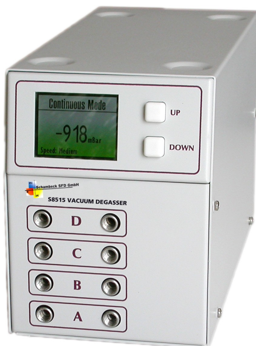
Figure: S 8515 vacuum degasser

The S 8515 vacuum degasser is available as 1-channel, 2-channel, 3-channel or 4-channel version and also in a PEEK—metal free version. Each solvent channel can be used for a different solvent or several channels can be used in series to increase the efficiency even more.